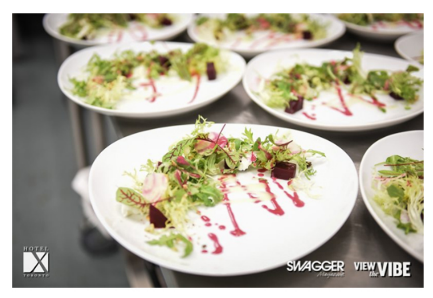
First was a Winter Caprese salad served at the Hotel X NYE Party hosted by The Opulent Club x Swagger Magazine.

As if the great tunes, and even greater company weren't enough... the dinner really did hit the spot. Starting it off with a delicious salad, followed by a perfectly cooked entree, whether it was a beef steak, fish or vegetarian dish, and ending it off with a deliciously decadent chocolate dessert.