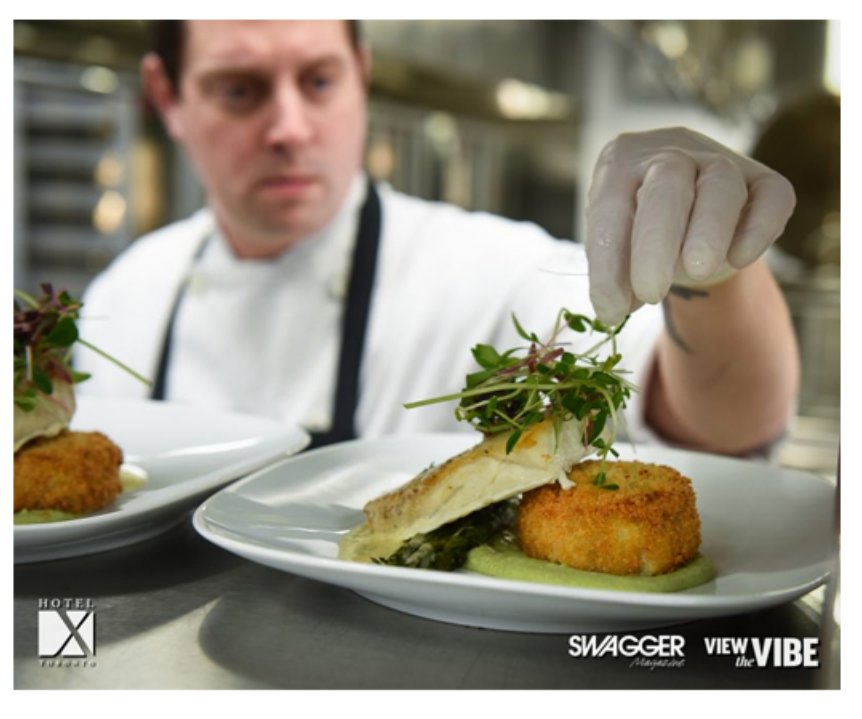
byPeterandPaul's chef places finishing touches on the fish entree dishes served at the Hotel X NYE Party hosted by The Opulent Club x Swagger Magazine.