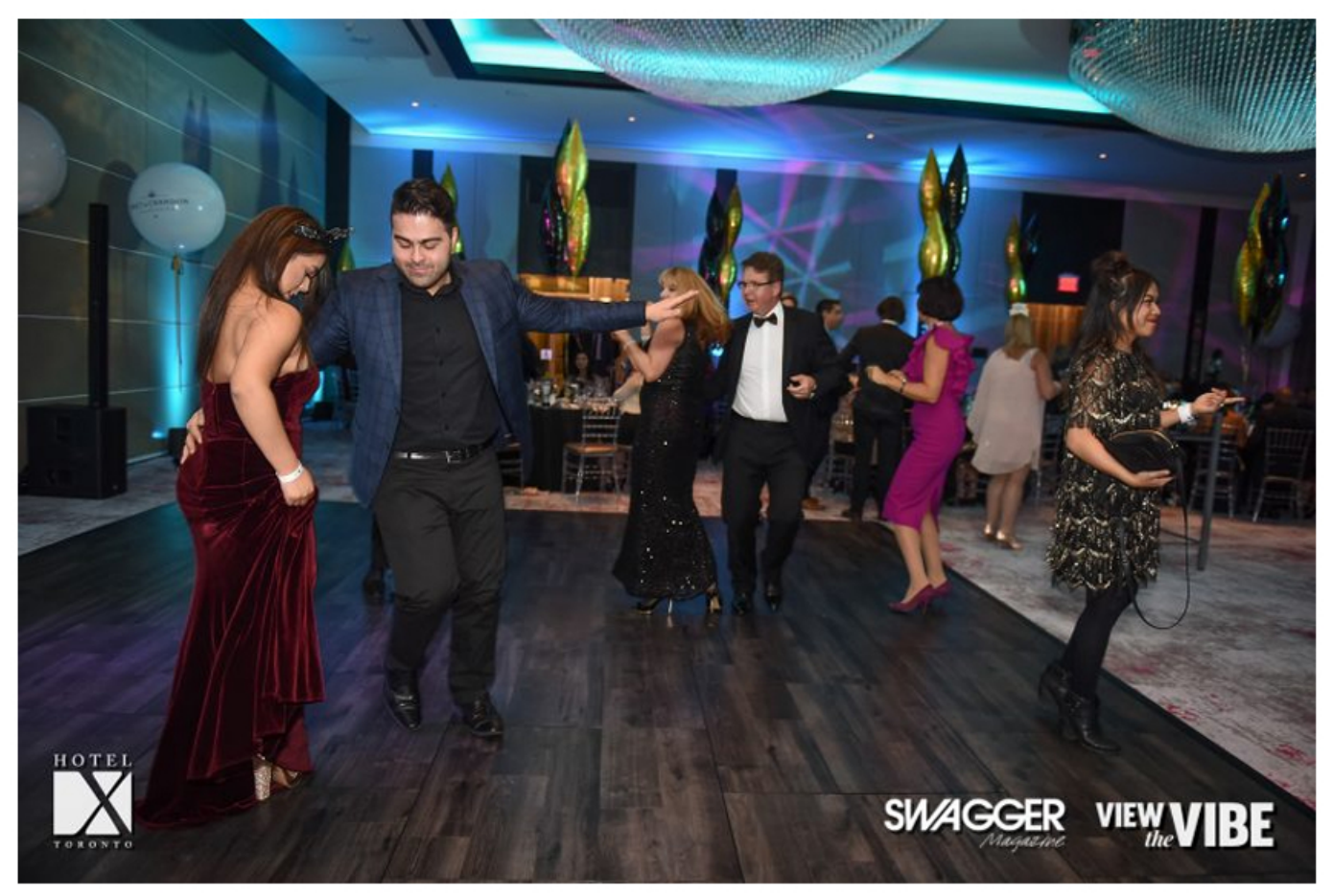
Guests hitting the dance floor at the Hotel X NYE party

After all that, the guests still did not hesitate to jump onto the dance floor whenever one of the fav hits came on. They danced right through the night.