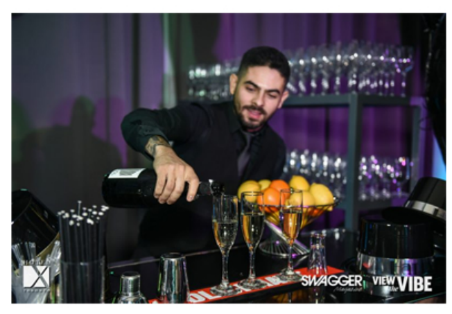
Pouring bubbles for guests on arrival at the Hotel X NYE Party hosted by The Opulent Club x Swagger Magazine.

There's no other way we can think of to better ring in the new year. Mother nature wasn't quite on our side this year, and decided to wash away 2018, but that didn't stop any of these guests from looking HOT AF. As the beautiful crowd started to fill the room, guests were greeted with bubbles and delicious hors d'oeuvres.