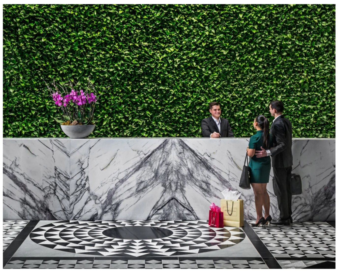
The living wall in the Hotel X lobby.