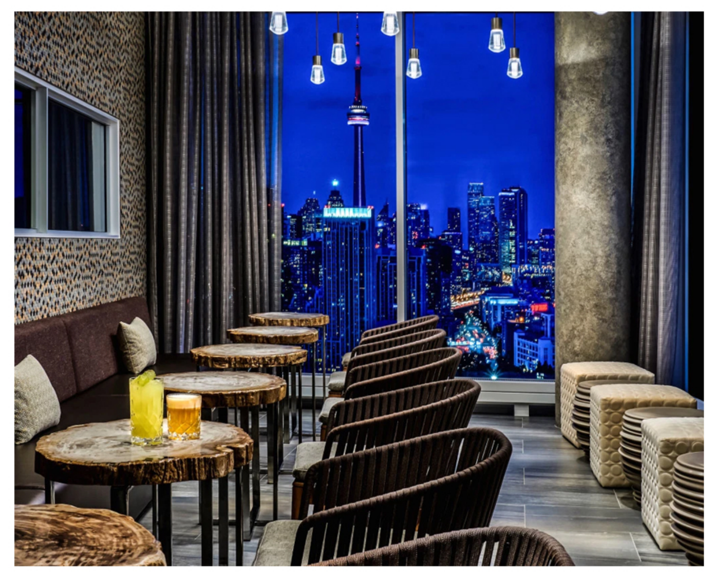
'The Perch' at the Falcon Skybar.

The lobby-level dining room joined previously opened Maxx's Kitchen, a more casual eatery for crisp flatbread, robust salads, and comforting fish and chips; as well as Falcon SkyBar, a three-floor cocktail lounge with unobstructed views of Toronto. It's named after the bird of prey because on a clear day, falcons can sometimes be seen swooping around the sky. But if not, there's always the opportunity to watch planes take off and land from Billy Bishop.