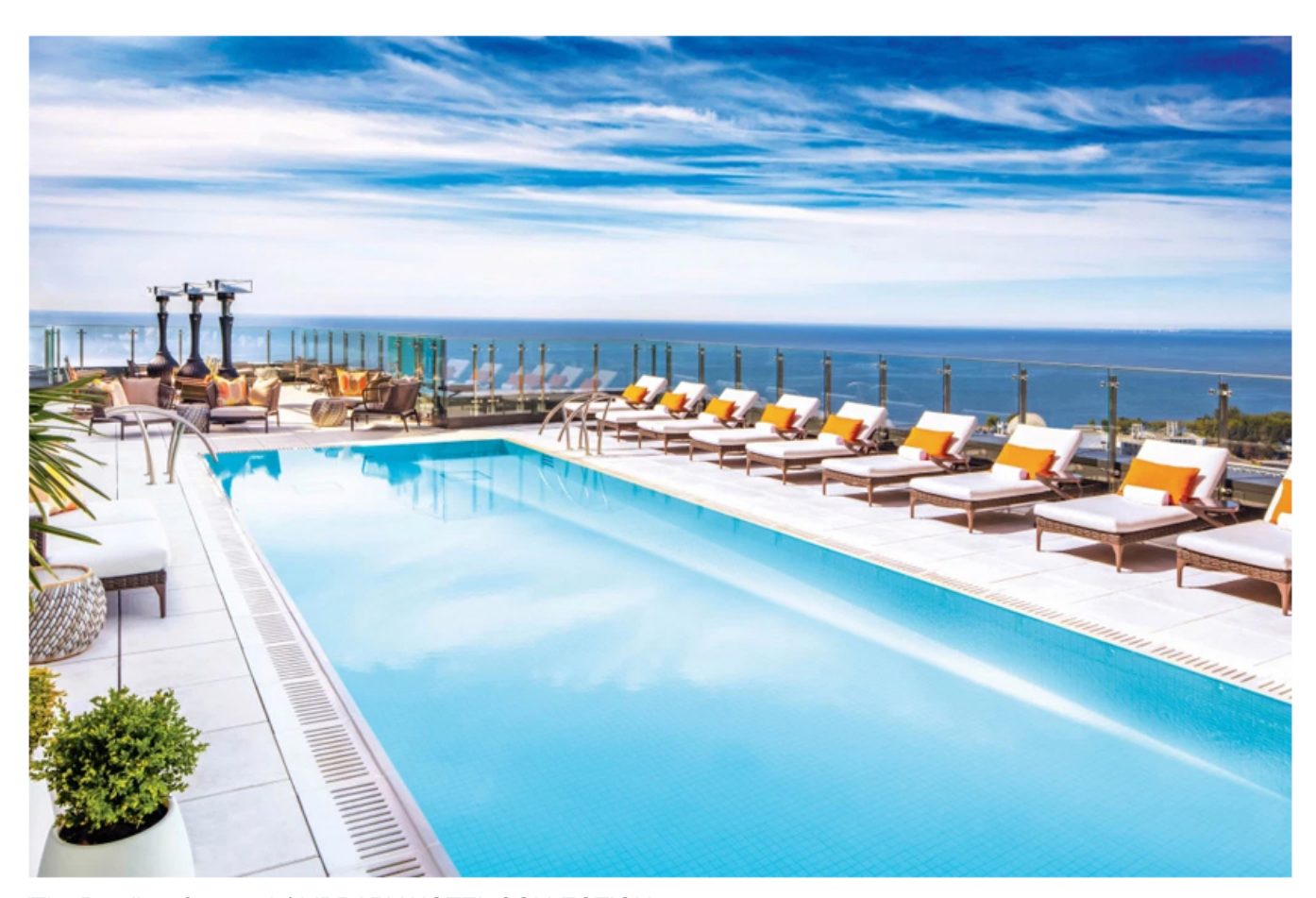
'The Pond' rooftop pool. | LIBRARY HOTEL COLLECTION

There's also an enormous 90,000 square-foot athletic complex called Ten X Toronto, which is in fact a membership-only fitness club that is open to overnight guests, making it the largest hotel gym in the country. It's equipped with dedicated studios for yoga, spinning, Pilates, and group classes; nine glass-back squash courts; a golf simulator; and soon its own lap pool. (Though there is already a heated indoor-outdoor rooftop pool on the building.)